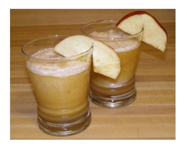
Apple Cider Slushy Contribution from: Abigail Dow

Moral of the story: Do not overcrowd the garden with negativity, lest you invite the foot of a Goddess to land on your head.