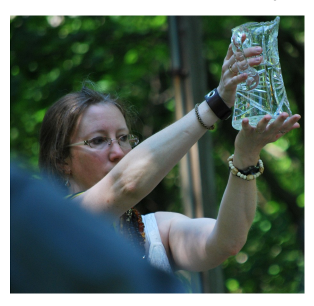
Three Cranes Grove, ADF

- Tanrinia Senior Druid, Three Cranes Grove, ADF