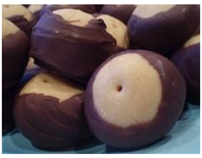
Three Cranes Grove ADF