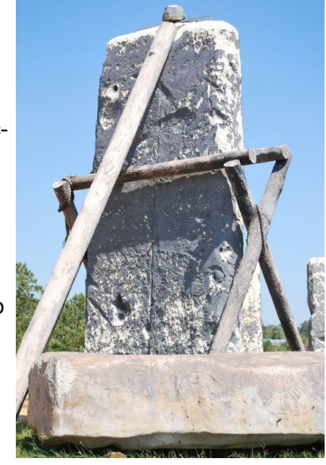
Three Cranes Grove ADF

Like the original, Foamhenge is visited by bus loads of people taking snapshots and laughing at the creativity and anecdotes posted along the uphill path. As a bonus, it is free. The magnitude of their size, what the stones looked like, and what was needed to erect them are clearly evident for any that take the time to visit. What must have been sacrificed to formulate such a meditative ceremonial space in Wiltshire, one can come close to understanding with Foamhenge. And it leaves you feeling tiny. The creator of Foam