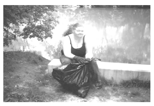
Carmen (Sitting By the Dock of the Bay)

The park was alive with people and dogs everywhere, but either we are keeping up on it or ... *GASP*... maybe people are cleaning up after themselves.