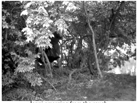
Jenni emerging from the rough

Carmen headed through the middle of the park, and I walked the tree line on the East side of the park. The park was in great shape with very little to pick up.