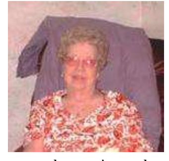
~ love ya' grandma!

2 tbsp. soft butter 8 oz. cream cheese 3/4 tsp. vanilla 1 c. powdered sugar